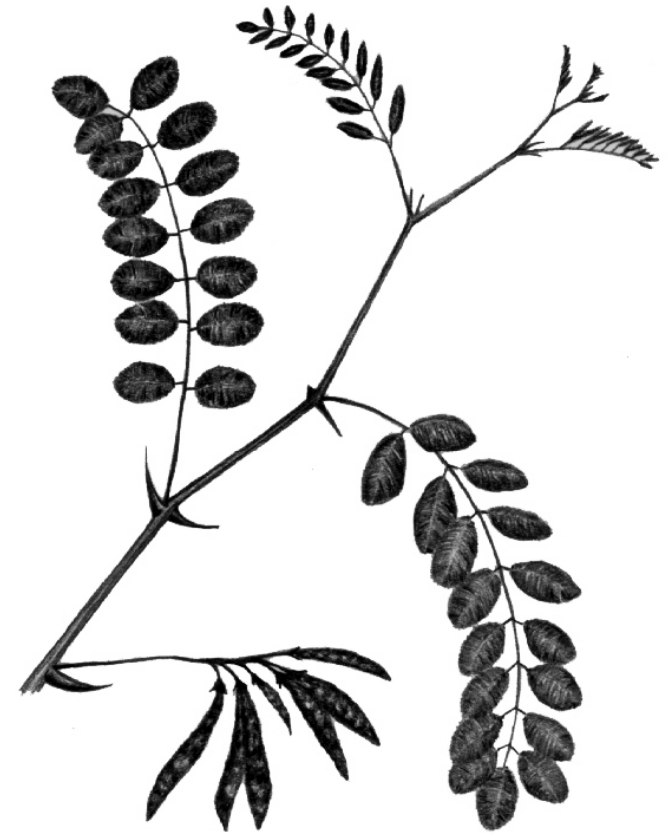
New Mexican Locust

March. In the inmate park a few white iris blooms peel